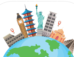
International Exposure Course/Modules