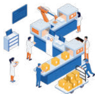
Industry Interface Sessions