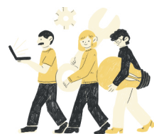
Research Based Learning