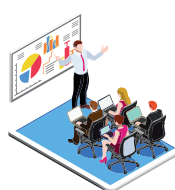
Industry based Short Term Courses