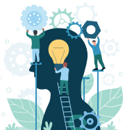
Mentorship Based Learning